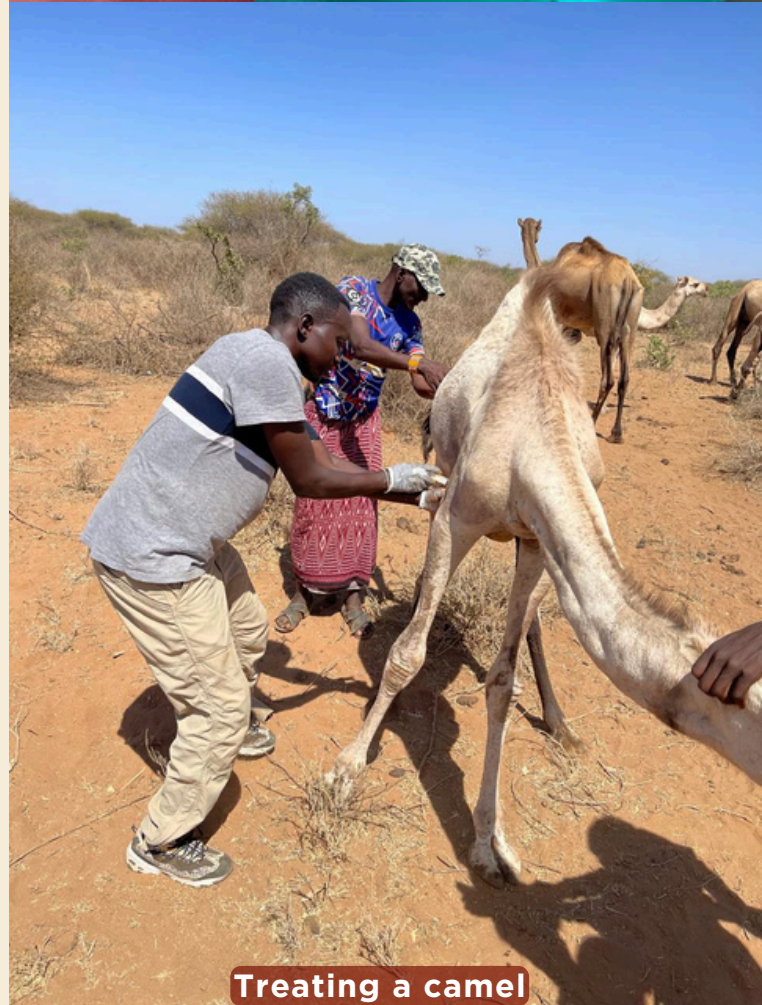
Treating a camel