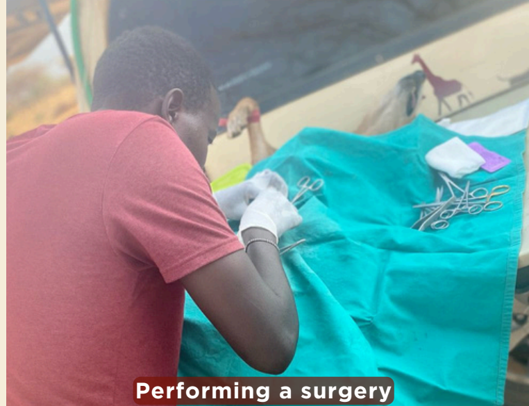
Performing a surgery

We thank our partners, Samburu County Department of Veterinary Services, VetinWild, Animal Care Centre, Foundation for International Aid to Animals and Action for Cheetahs.