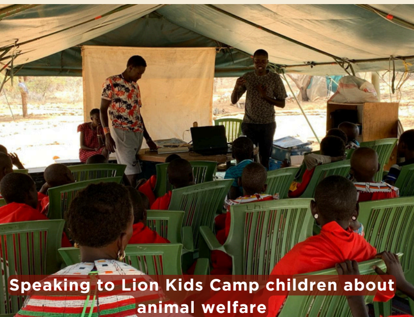
Speaking to Lion Kids Camp children about animal welfare