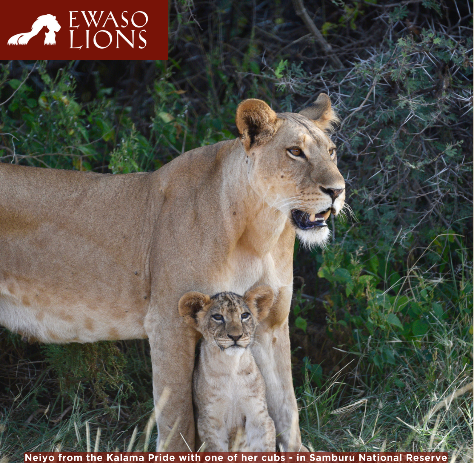
Neiyo from the Kalama Pride with one of her cubs - in Samburu National Reserve