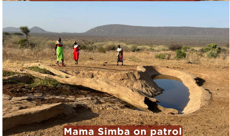
Mama Simba on patrol