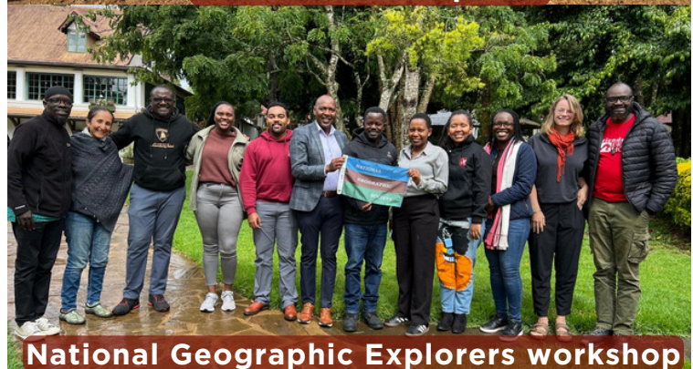
National Geographic Explorers workshop