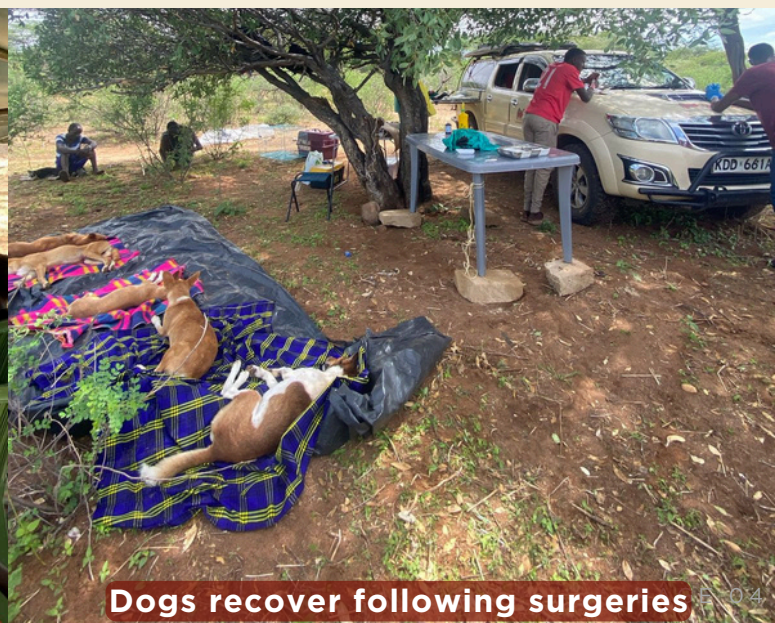
Dogs recover following surgeries