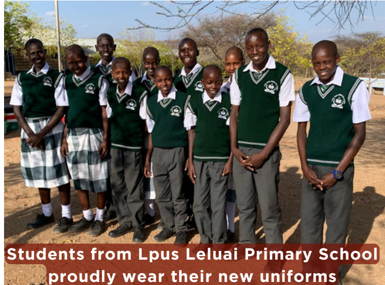
Students from Lpus Leluai Primary School proudly wear their new uniforms