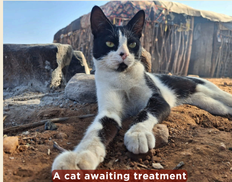
A cat awaiting treatment

We thank our partners, Samburu County Department of Veterinary Services, Vet in Wild, Animal Care Centre, Foundation for International Aid to Animals and Action for Cheetahs.