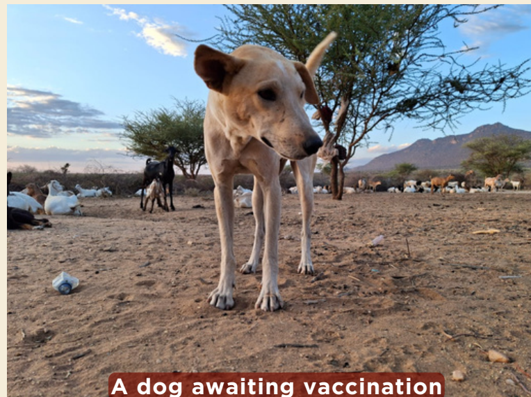
A dog awaiting vaccination