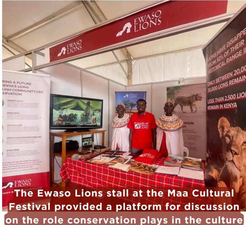
The Ewaso Lions stall at the Maa Cultural Festival provided a platform for discussion on the role conservation plays in the culture

We also completed Leadership and Management (LAMP) training for 30 community members from 4 Conservancies in the areas we work in over the last quarter of the year.