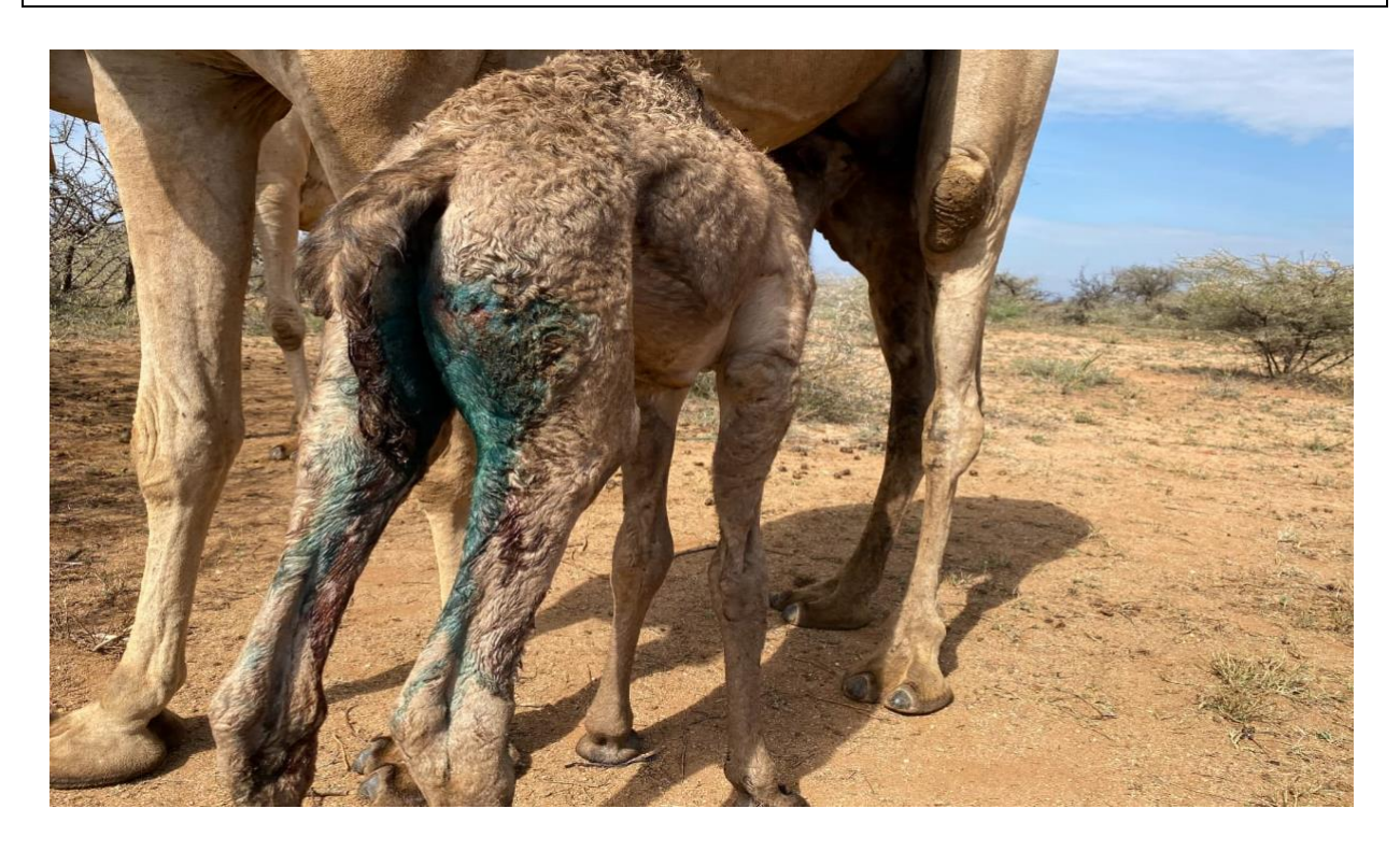
Treatment of a camel calf injured by hyaena.

EMERGENCY TREATMENT: A total of 6 domestic animals received medical interventions after being injured by wild carnivores. These animals included 3 camels, 2 sheep and 1 donkey.