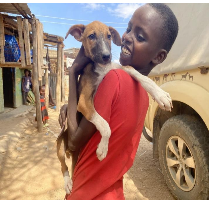
Issuing a vaccination card after vaccinations and a boy carrying his puppy after vaccinated by the vet at Archer's Post town.

CLINICAL AND PREVENTATIVE TREATMENTS: A total of 35 animals received clinical treatments for any sickness reported as well as preventative treatments. This included deworming, injuries from wild carnivores and ectoparasite control. Part of the clinical treatment included treatment of 12 dogs that had suspected Canine Distemper.