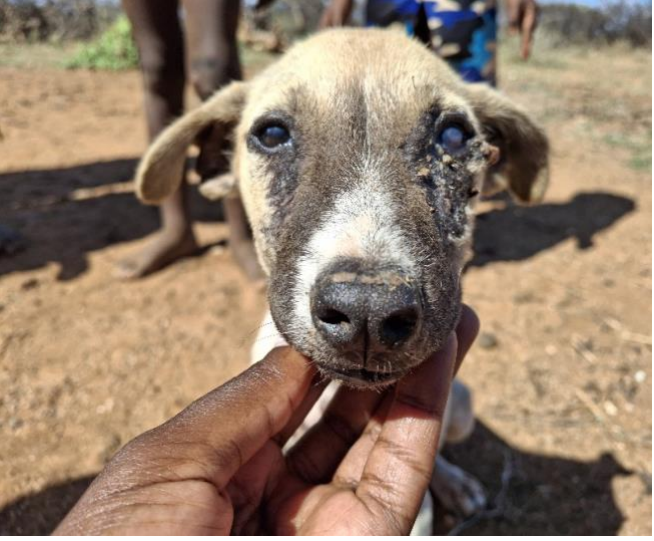
Treatment of a dog injured by a baboon and a puppy with cataracts