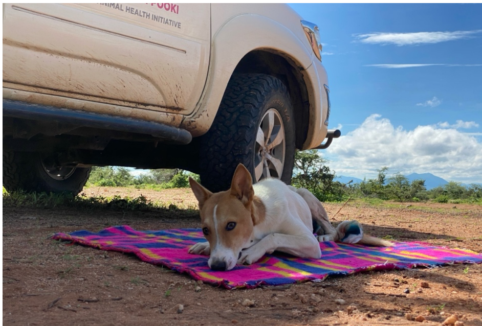
Dog recovering after a castration surgery

DOG POPULATION CONTROL: A total of 1 dog received population control services. This was an emergency surgery due to complication from local population control methods.