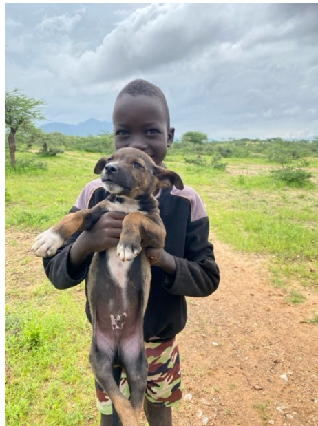
Treatment of puppies for ectoparasite infestation

EMERGENCY TREATMENTS: A total of 6 animals were also treated as emergency cases. These cases included 1 camel attacked by a lion and 2 donkeys attacked by hyenas.