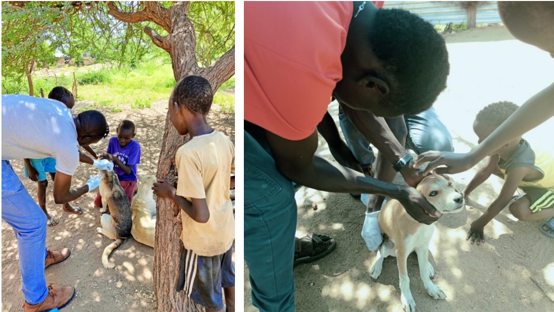
Vaccination of dogs and cats at Archer's Post town area

VACCINATIONS: A total of 52 dogs and cats have been vaccinated. Out of this, 42 (80.7%) were dogs and 10 (19.3%) were cats. The dogs were vaccinated against Rabies and Canine Distemper while the cats were vaccinated against Rabies and Cat Flu.