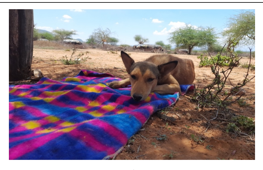
Dogs undergoing and recovering from population control surgeries

DOG POPULATION CONTROL: A total of 2 dogs received population control services. These were emergency surgeries due to complication from local population control methods.