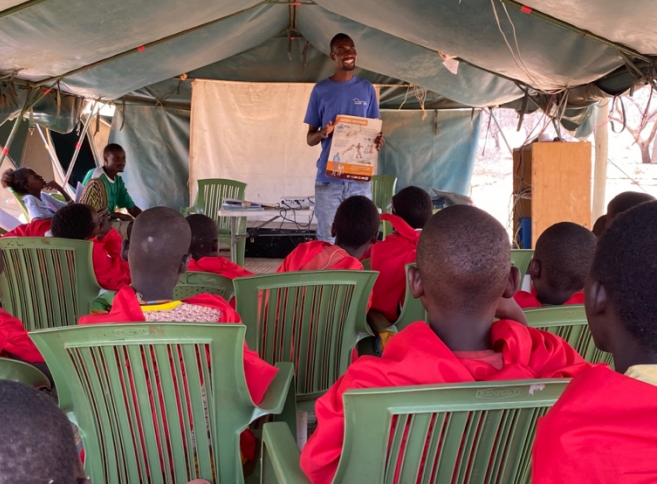
Teaching children from a local school on responsible animal ownership and talking to children at the Lion Kids Camp