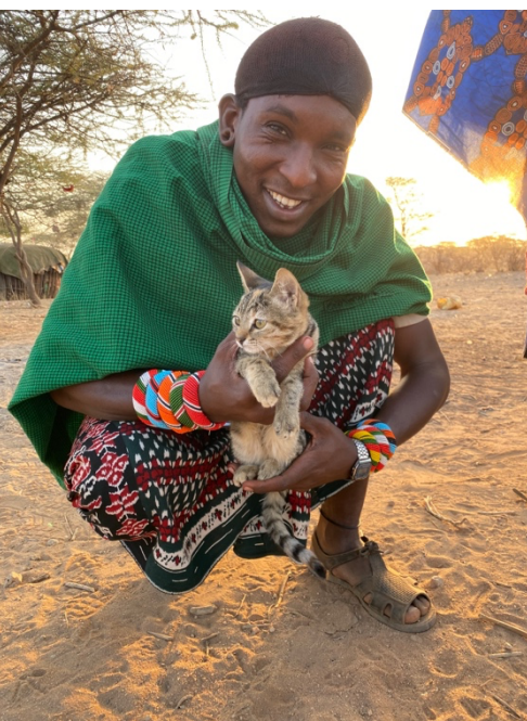
Pre-vaccination awareness and vaccinations of dogs and cats in Kalama Community Conservancy

DOG POPULATION CONTROL: A total of 2 dogs received population control services. These were emergency surgeries due to complication from local population control methods.