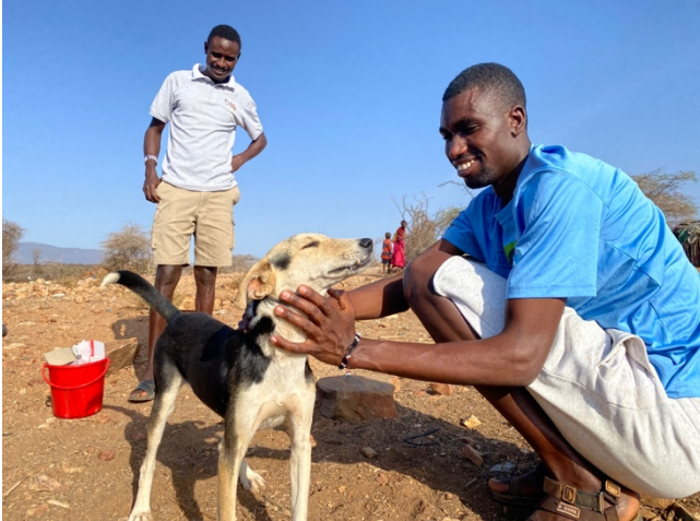
Treating a donkey attacked by a lion and examination of a dog for ectoparasites

EDUCATION: So far, we have reached 216 people through the various education campaigns. This includes: 2 Lions Kids Camps, 2 warrior camps and 1 local school visit.