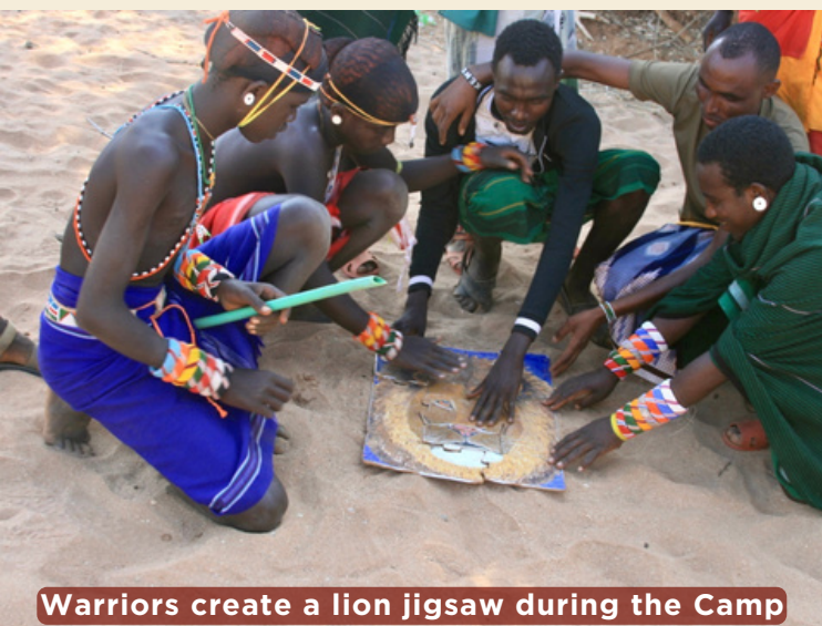
Warriors create a lion jigsaw during the Camp