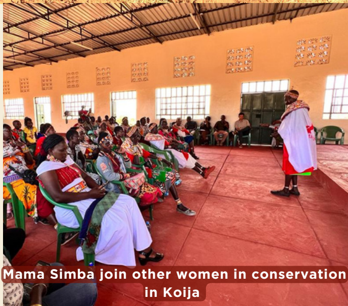
Mama Simba join other women in conservation in Koija