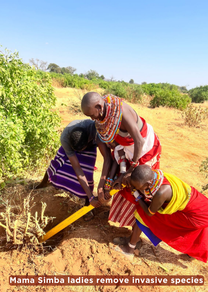
Mama Simba ladies remove invasive species