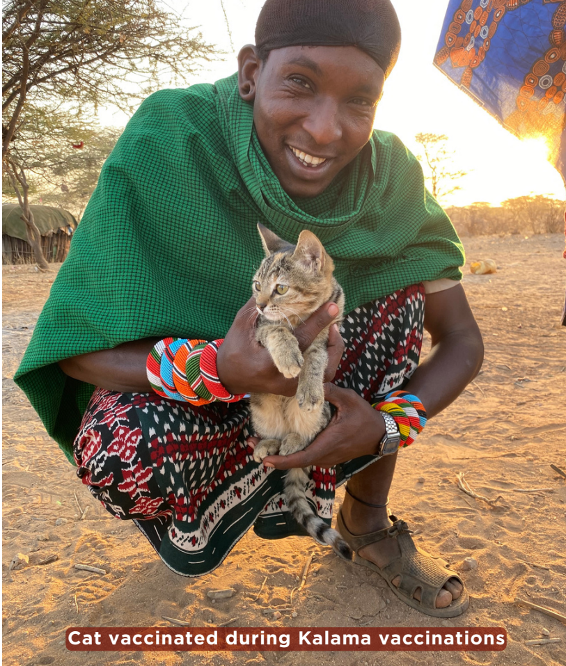
Cat vaccinated during Kalama vaccinations