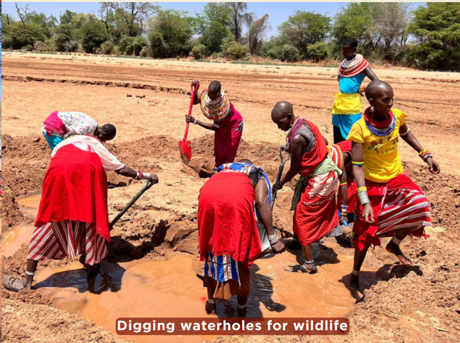
Digging waterholes for wildlife