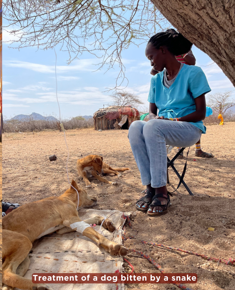
Treatment of a dog bitten by a snake