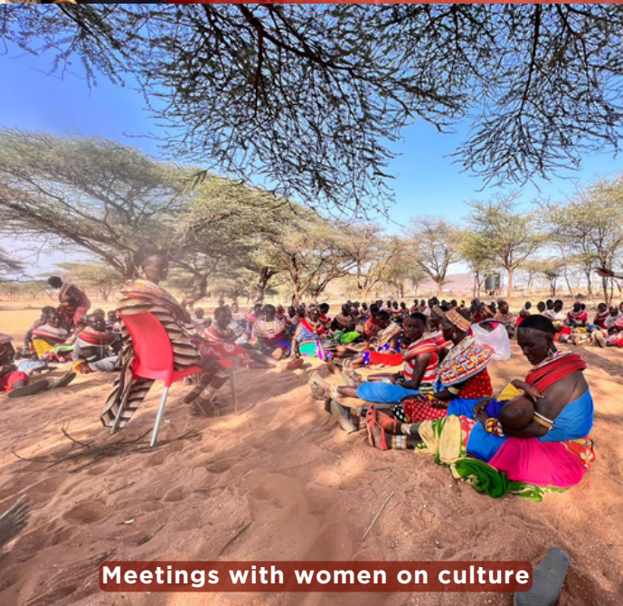
Meetings with women on culture