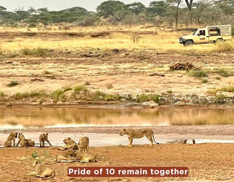
Pride of 10 remain together