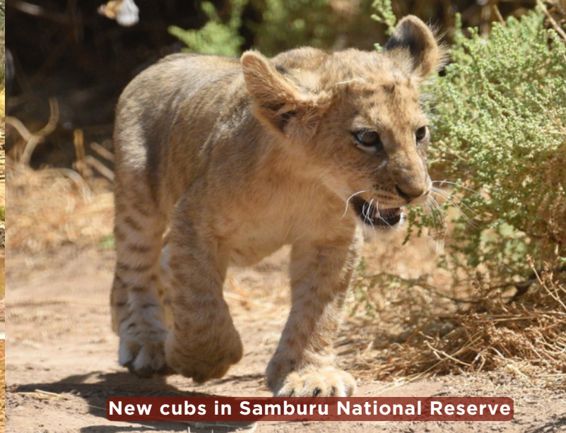
New cubs in Samburu National Reserve