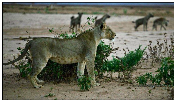
One of Naramat's large cubs