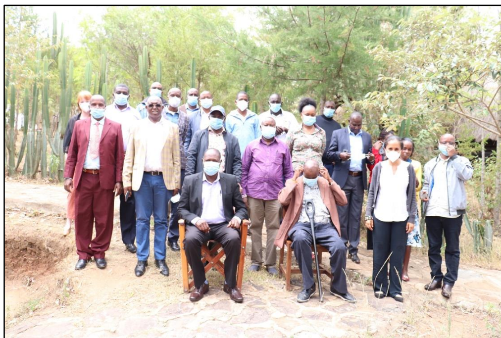
Participants at the meeting give presentations, listen to speakers and pose for a group photo.

Special Appreciation: Thank you so much to all our partners who enable us to make a conservation impact in Kenya including; Kenya Wildlife Service; Samburu, and Isiolo County Governments; Samburu, Buffalo Springs and Shaba National Reserves Managements; Community Conservancies (Westgate, Kalama, Nasuulu, Nakuprat-Gotu, Ol Donyiro, Meibae, Leparua, Il Ngwesi, Lekurukki, and Namunyak).