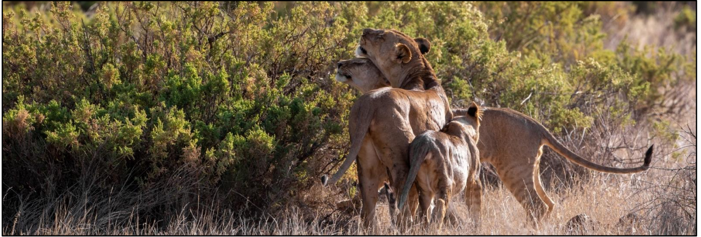
Nanai and her cubs