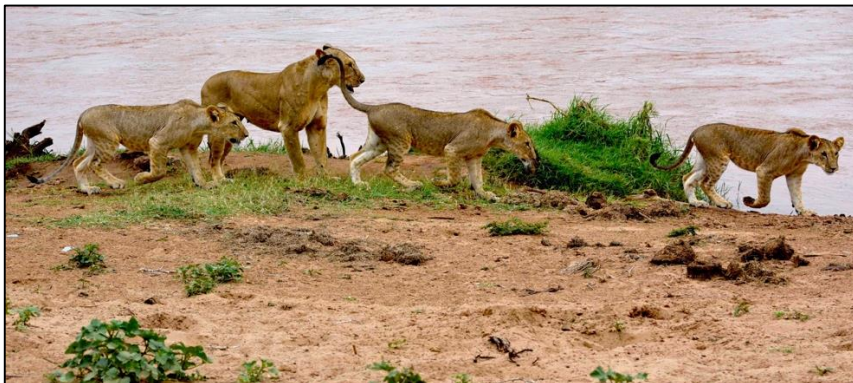
Nanai and her 3 cubs