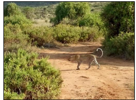
Participants during our Covid safe safaris to Samburu National Reserve

Special Appreciation: Thank you so much to all our partners who enable us to make a conservation impact in Kenya including; Kenya Wildlife Service; Samburu, and Isiolo County Governments; Samburu, Buffalo Springs and Shaba National Reserves Managements; Community Conservancies (Westgate, Kalama, Nasuulu, Nakuprat-Gotu, Ol Donyiro, Meibae, Leparua, Il Ngwesi, Lekurukki, and Namunyak).