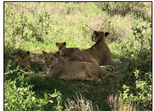
Napirai brings out her new cubs